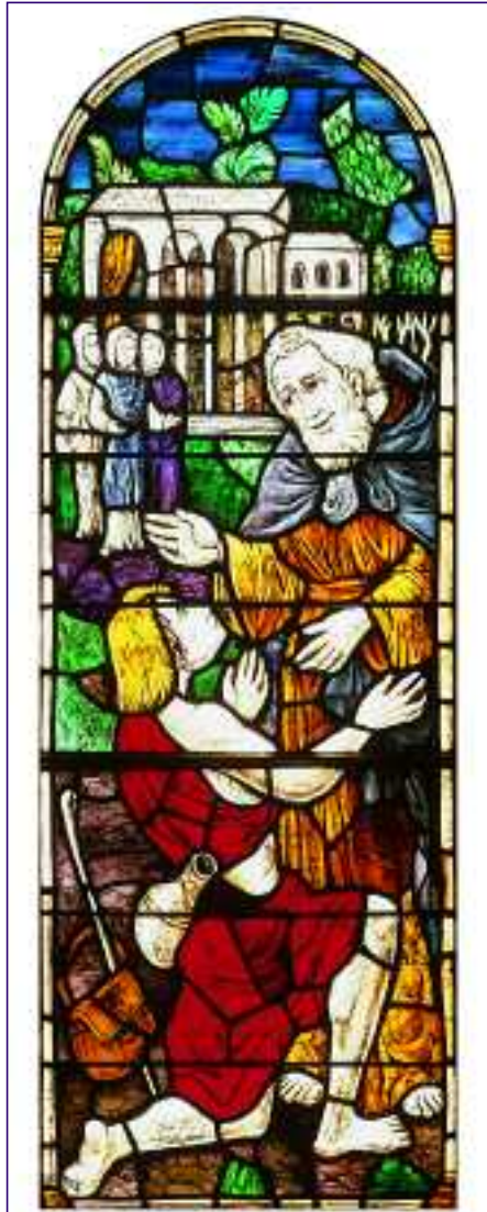
Return of the Prodigal Son, stained glass window in Shrine.

For up-to-date information, contact us at shrine@marian.org or at (413) 298-3931.