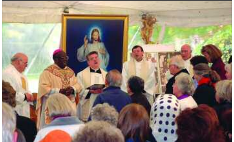
Pilgrim mass at the Shrine's annual celebration for St. Faustina.

I have always greatly admired and esteemed our Holy Father, Pope John Paul II. My esteem and affection for him is on many levels. But the heart of it all may be expressed in the words of his pontifical motto: Totus Tuus . In English that means "I am all Thine." His motto is taken from the writings of Saint Louis Marie