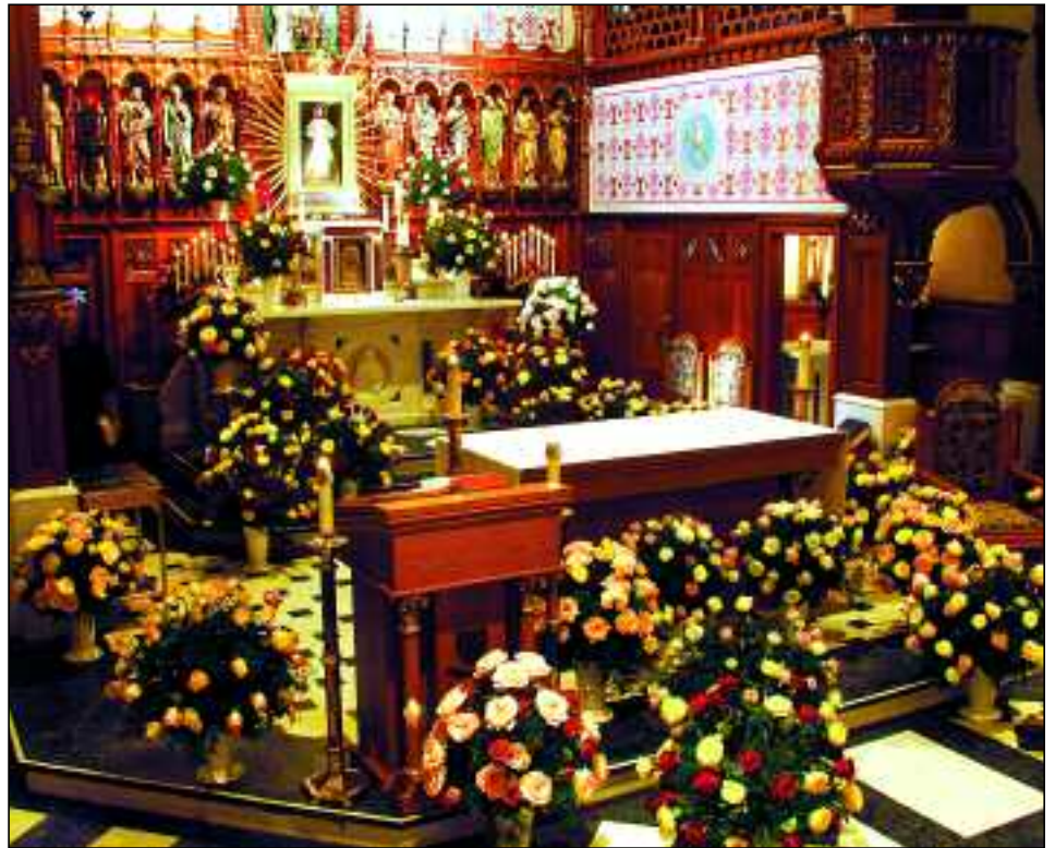
Roses placed in the Shrine sanctuary to honor Our Blessed Mother.