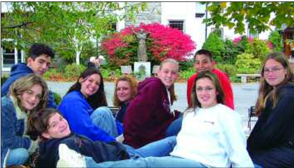
A group of young pilgrims enjoying their time at the Shrine.

of Mary with the words, Totus Tuus o Maria . In a particular way, our affection for our Blessed Lady is stirred by the 150th anniversary year of the proclamation of the doctrine of the Immaculate Conception by Blessed Pius IX in 1854. We look to Mary, the Mother of Mercy, to be our motto. Mary is a University in which we are educated about her Son. In the University of Mary, we learn as our Holy Father teaches us to gaze with her in wonder and awe upon Christ.